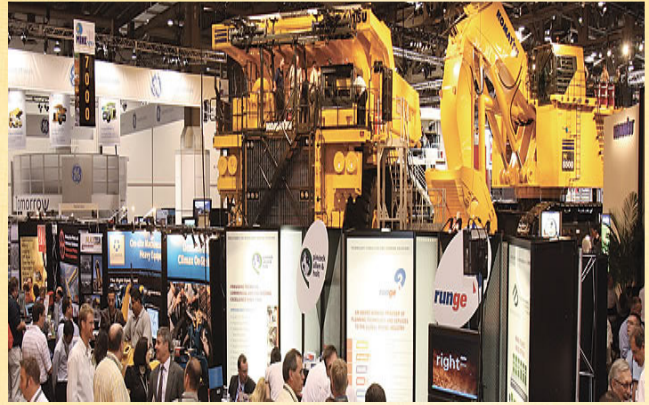
Maximize your exposure – MINIMIZE the costs!

Fees & Confidentiality: All fees are expressed by individual quote. Initial consultations are available at no charge. I provide a 'blanket' statement of Non-Disclosure with each consulting/agency agreement executed.